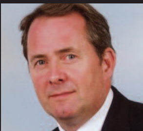
Dr Liam Fox MP North Somerset Secretary of State for Defence