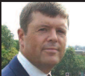
Paul Burstow MP Sutton & Cheam Minister for Carers

Visit http://carersweek.org/parliamentary/mps-who-support-carers to read the statements of support from MPs who have responded to our call for them to express their support for carers and Carers Week.