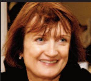
Tessa Jowell MP Dulwich & West Norwood